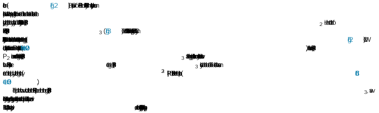
Fig. 3. [Redacted]